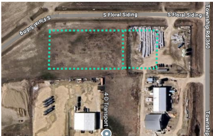
Image: Aerial view of the future site for Northern Nutrients' sulphur manufacturing plant in the East Floral Industrial Park